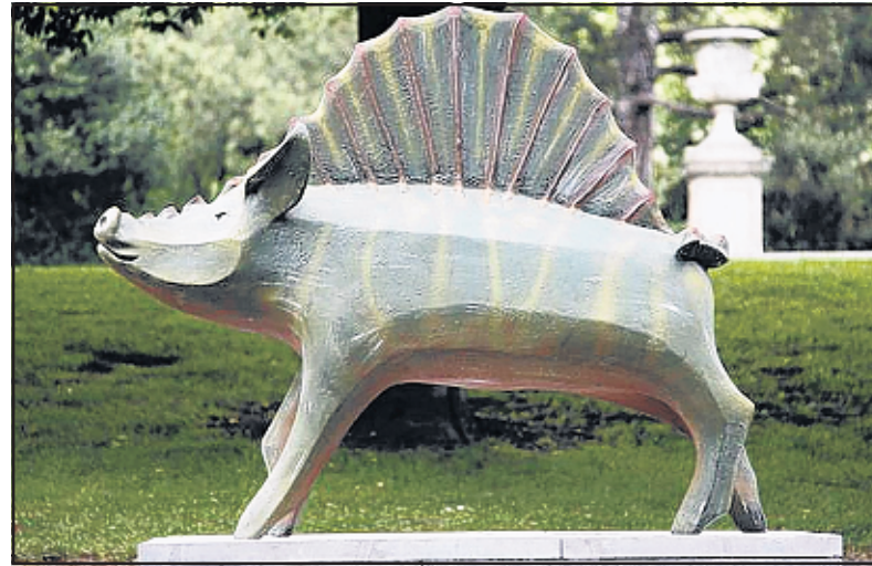
LOST AND FOUND: Dinopig was stolen from Royal Victoria Park but has been recovered

ing Cowpig will be brought back or found, too.